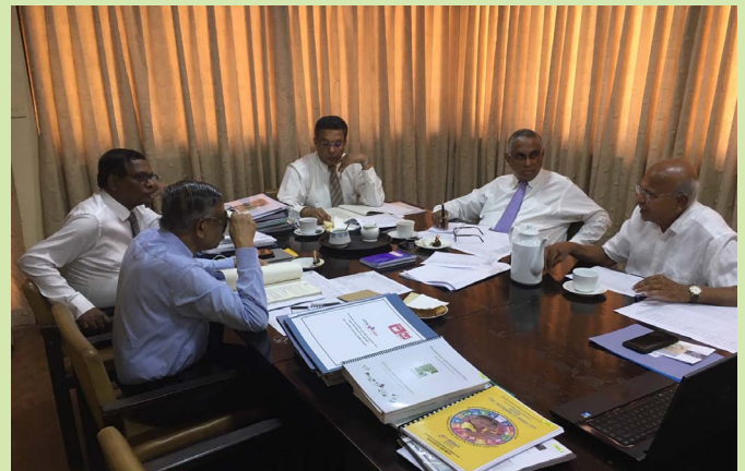
The CSR panel of judges evaluating the entries