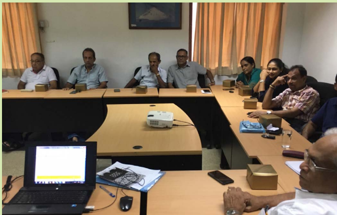
Final evaluation meeting with the audit panel in progress